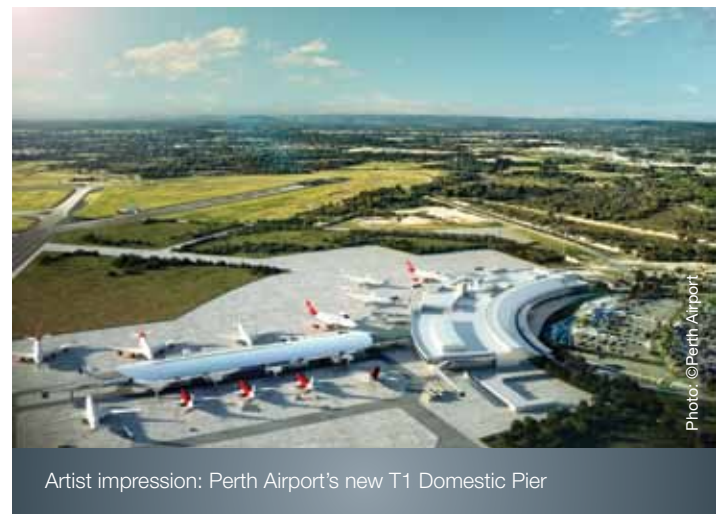
Artist impression: Perth Airport's new T1 Domestic Pier

The increase in activity at Perth Airport and regional airports provides opportunities for expansion and upgrades of this vital infrastructure.